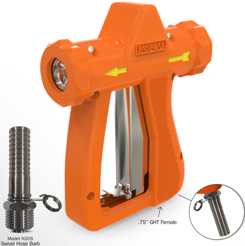
Model N20S Swivel Hose Barb