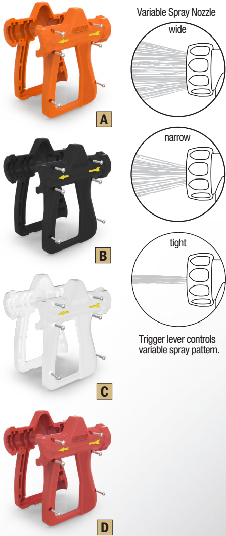
.75" GHT Female