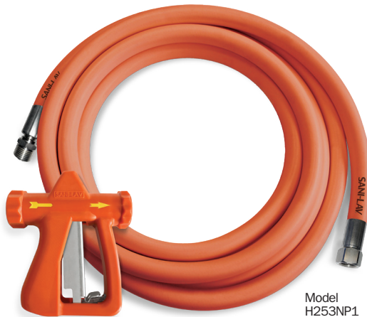
Model H253NP1 H503NP1