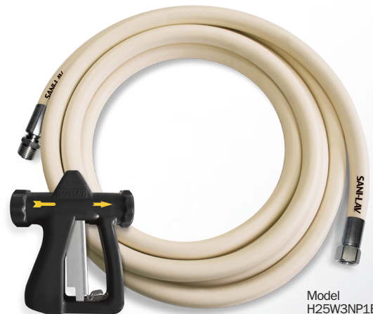
Model H25W3NP1B H50W3NP1B

NOTE: Materials are bound in a solid form and do not present a route of exposure for a consumer. Consistent with the California Proposition 65 list of chemicals known to cause cancer or reproductive toxicity, these chemicals would need to be in an airborne, unbound particle of respirable size for them to be toxic.