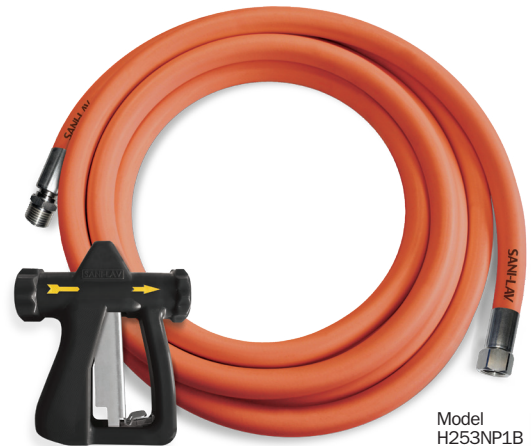
Model H253NP1B H503NP1B