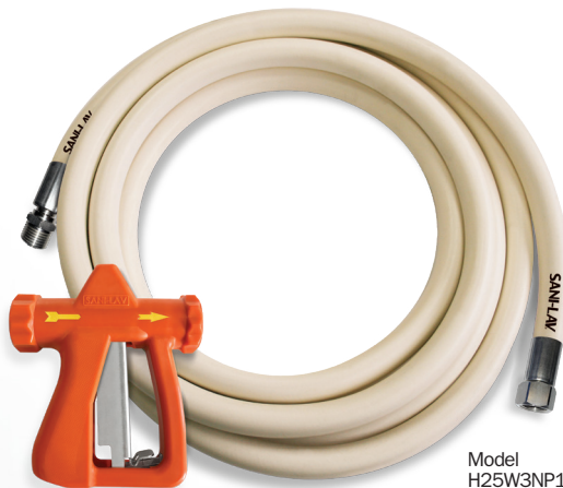
Model H25W3NP1 H50W3NP1