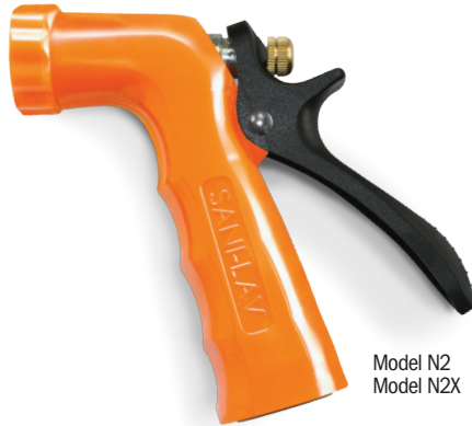
Model N2 Model N2X