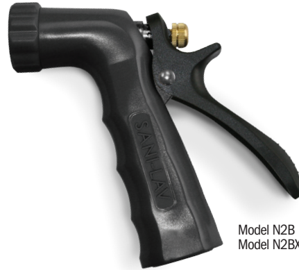
Model N2B Model N2BX