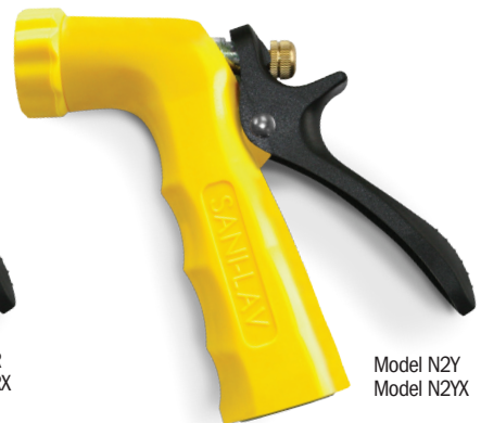
Model N2Y Model N2YX