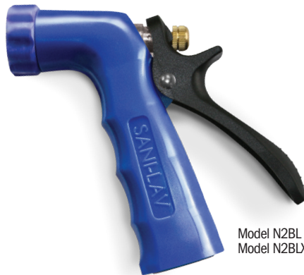
Model N2BL Model N2BLX