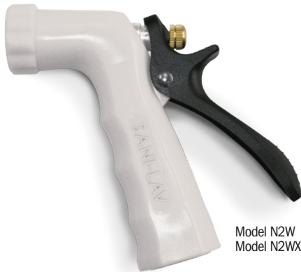
Model N2W Model N2WX