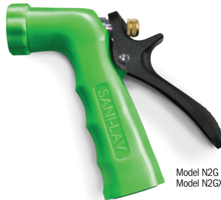
Model N2G Model N2GX