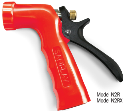
Model N2R Model N2RX