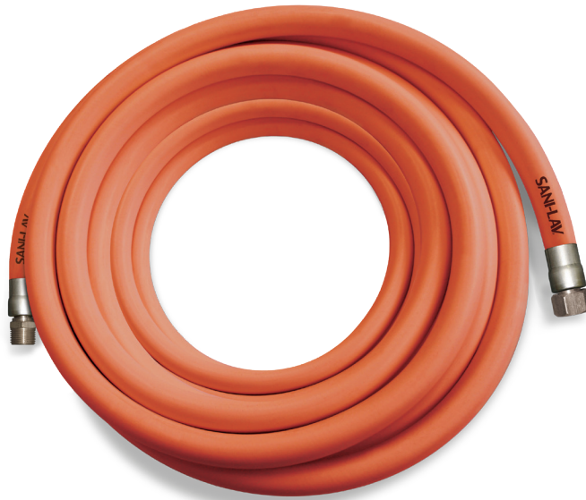
Model H253 Model H503 Model H753 Model H1003

Models H253, H503, H753, H1003, H25W3, H50W3, H75W3, H100W3