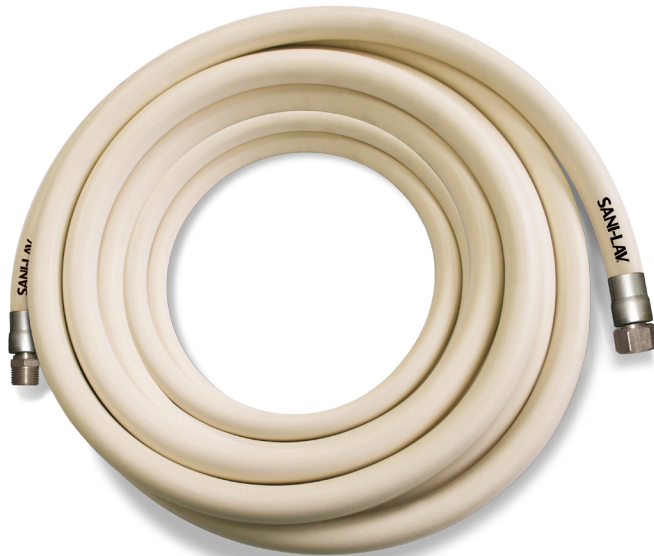
Model H25W3 Model H50W3 Model H75W3 Model H100W3